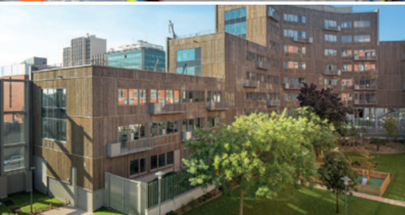
OPALLIA - © At&Build - Paul Kozłowski