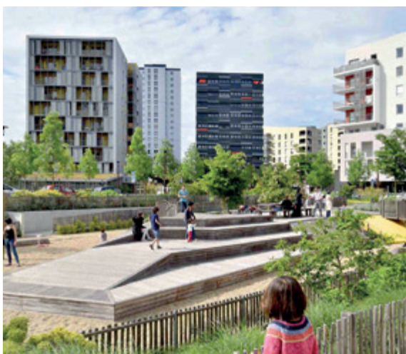
SQUARE DE LA BOLLARDIERE - © J-D Billaud