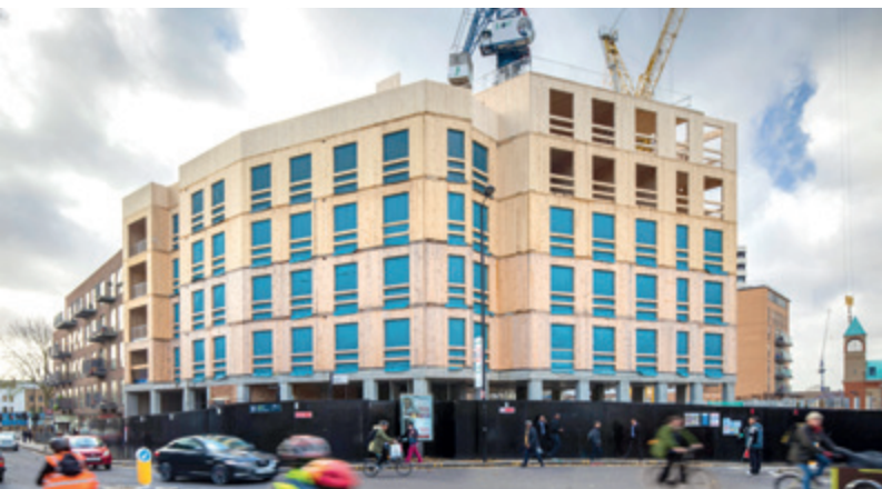
DALSTON LANE

Inscription is required via Imenard@atlanbois.com